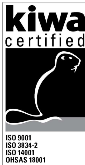
Inspecta Sertifiointi Oy