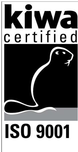
Inspecta Sertifiointi Oy